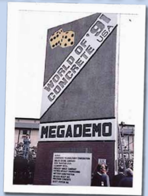
The World of Concrete demo reflected the Las Vegas theme with graphic inlays of lucky dice.

If you were there, send me an email at Buck@scottsystem.com .