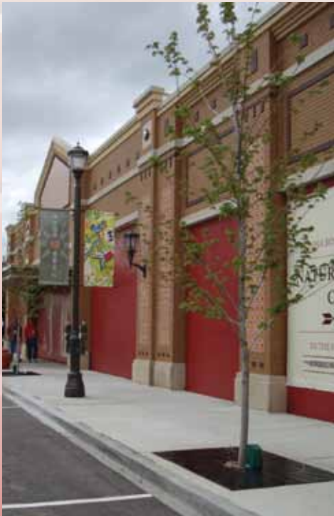
Buildings were constructed with cast-on-site load bearing wall panels. Because of tight site conditions, cranes were positioned on adjacent streets and panel erection was performed at night to avoid foot traffic.