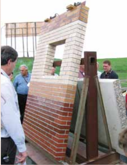
The ConSteel Alliance group examines tilt-up sample panels created with thin brick and the Brick Snap™ while touring Zona Rosa.

Using the Scott Brick Snap System™, the building panels were tilted-up successfully, resulting in admiration from architects and the site contractor.