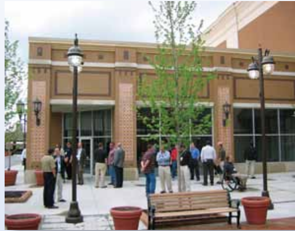
Architects and engineers discuss and admire the thin brick coursing patterns used to create Zona Rosa store fronts.

Architects challenged Summit Concrete, under the direction of Meyer Bros. Building Co., to execute complex design work, including intricate coursing patterns using a variety of brick colors and sizes.